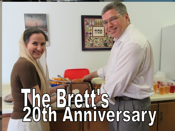
The Brett's 20th Anniversary