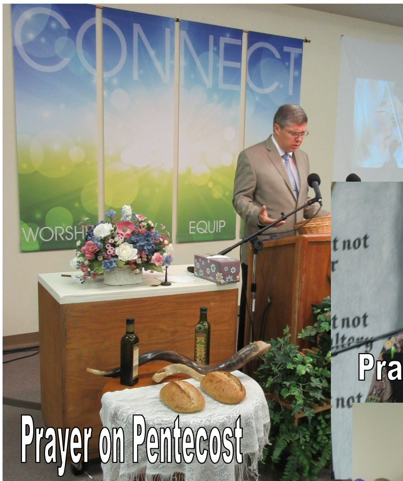
Prayer on Pentecost