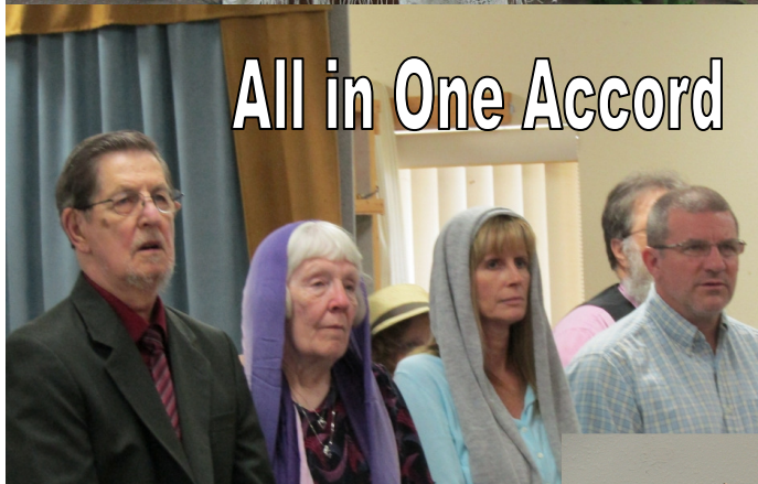
All in One Accord