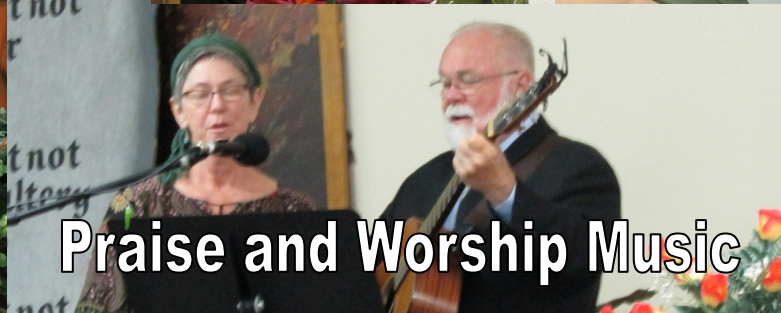
Praise and Worship Music